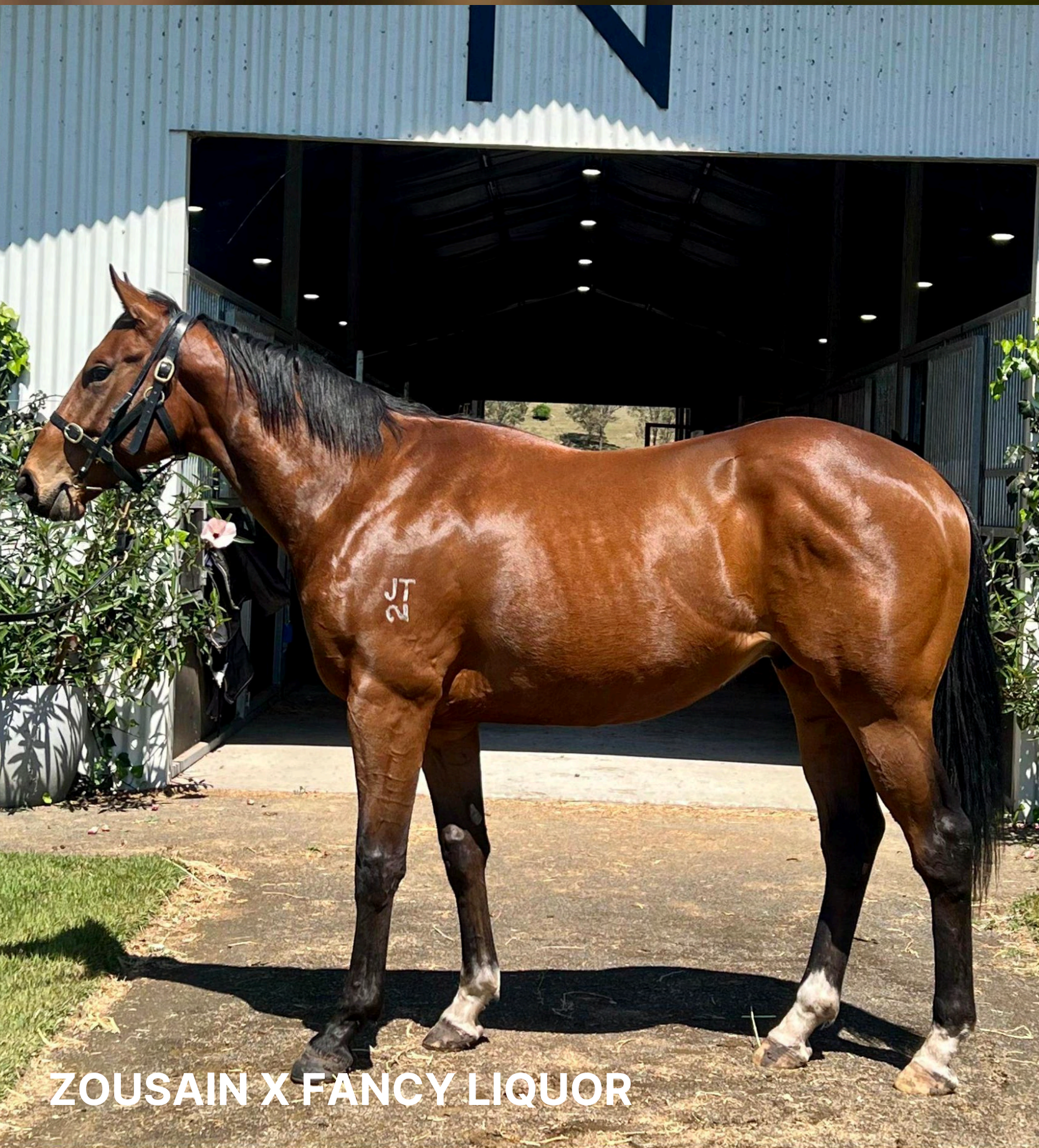
ZOUSAIN X FANCY LIQUOR